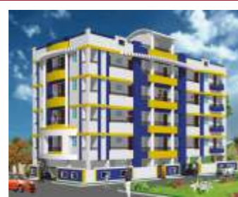
Shankar Nagar, Salem