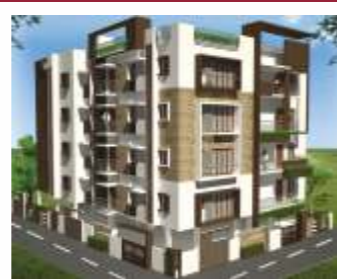
Five Roads, Salem