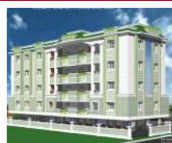
Gandhi Road, Salem